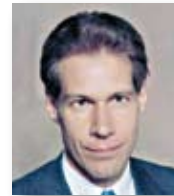
Editor, Allan Gerlat

As the only environmental industry newspaper, Waste & Recycling News' award-winning reporters and editors uphold its editorial mission by consistently delivering a comprehensive package of news, analysis, in-depth features, useful statistics and opinion in every edition of the newspaper.